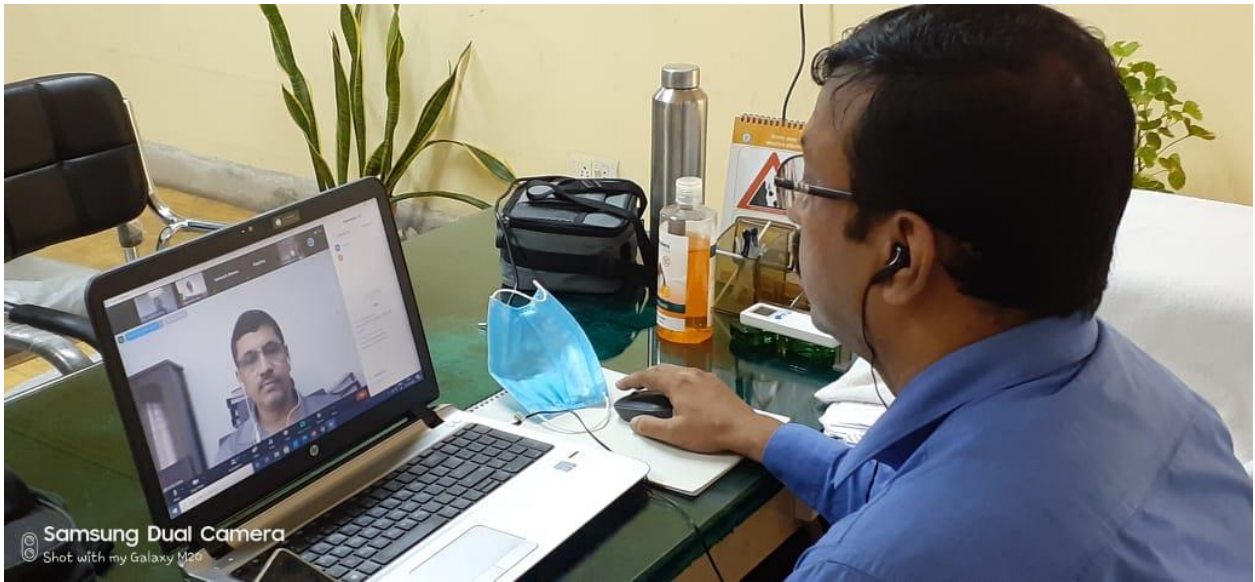
A session is in progress.